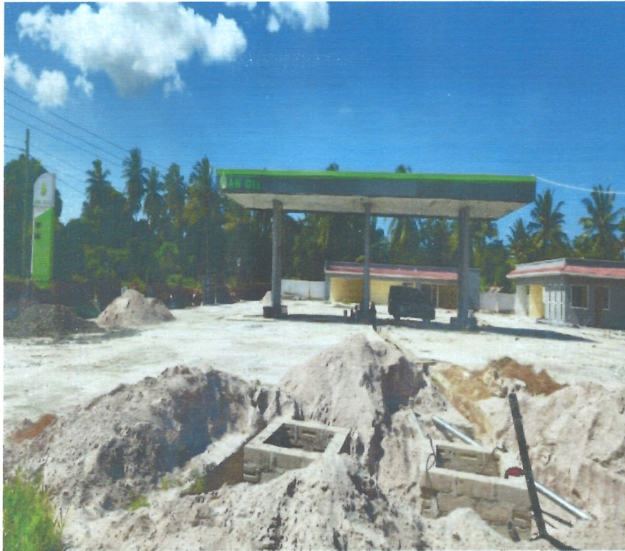
Picture: general view of the station.